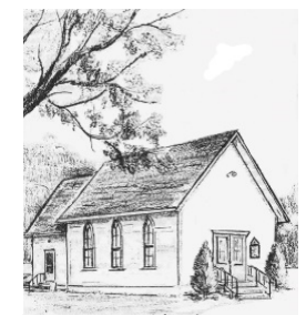
Drawn by...Mavis Tacher

The original building's entrance was at the east (street) end and the altar was at the west-end (where one now enters the sanctuary). Over time, newer pews were added, the mechanicals and organs were updated, and building additions were planned and built.